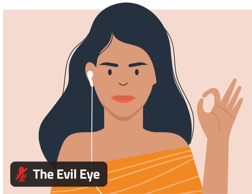
The Evil Eye

Showing the sole's of one's feet or shoes to another person is considered rude: be mindful of how you sit!